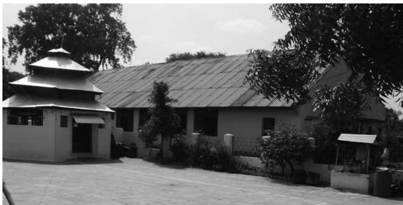
Figure 6 The 'natives only' asylum at Nagpur.